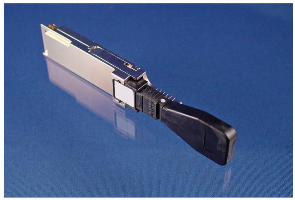
MPO Loopback with QSFP transceiver